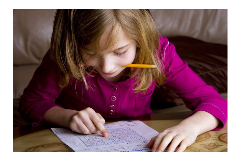
The Florida Statute Relating to Home Education